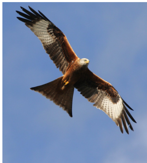
1 of 5 Red Kites over Briantspuddle