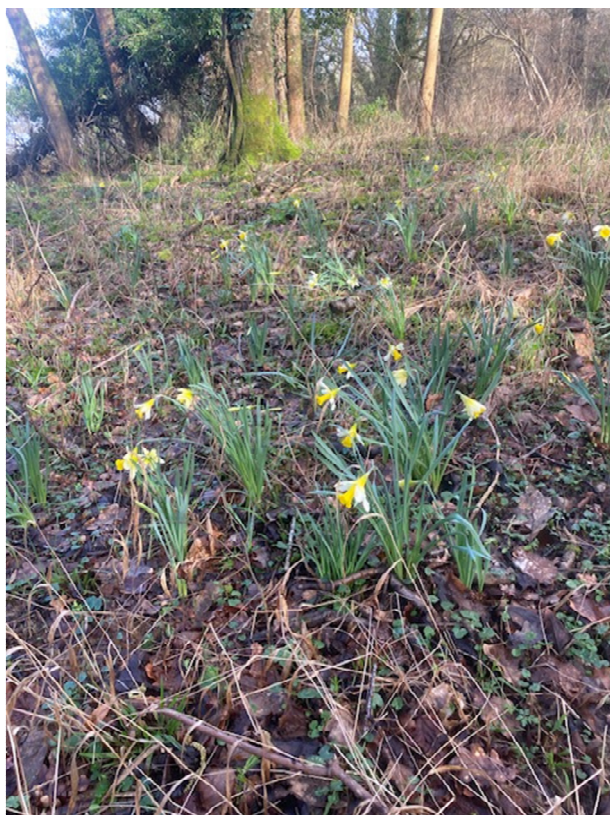
Lady Debenhams' Daffodils

These wild type daffodils, donated as bulbs to The Erica Trust by the Parish Council several years ago, continue to establish themselves in Briantspuddle Woods. These more delicate blooms have replaced the cultivated varieties planted to commemorate the World Wars, but are still known as 'Lady Debenhams' daffodils'.