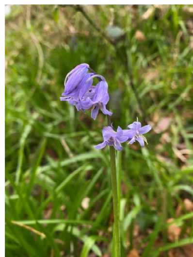
Some early Bluebells