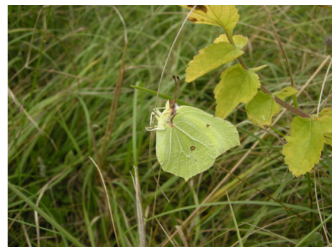
Woodlark and Brimstone Butterfly

The only other news is a pair of WOODLARKS singing on ERICA TRUST LAND. 25 th February a nice 15 degrees and my first Butterflies for this year while walking the heath with 9 Brimstone flying and 1 Peacock.