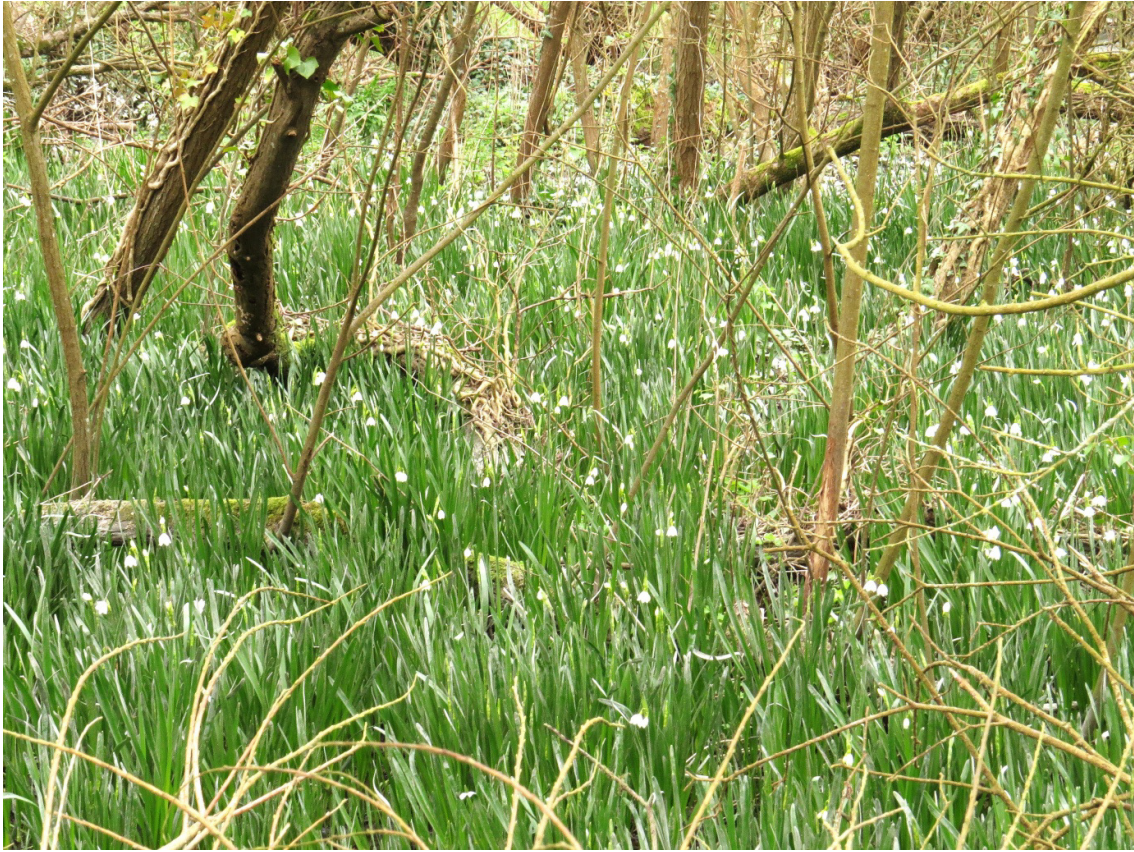
Snowflakes in flower

To think this area was under two feet of water not long ago and now the SNOWFLAKES are out in flower, nature is wonderful.