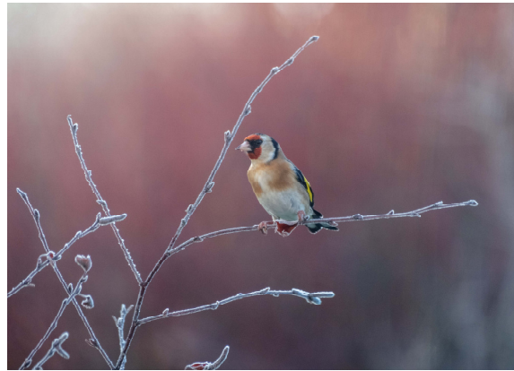
Goldfinch Not a rare sight but a memory of the frost in the garden when the Goldfinches arrived to feed.