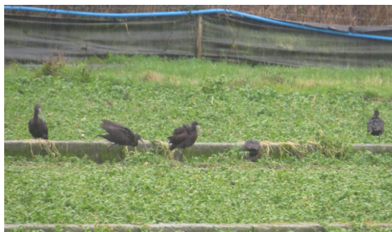
Glossy Ibis at Waddock Cross Water Cress Beds