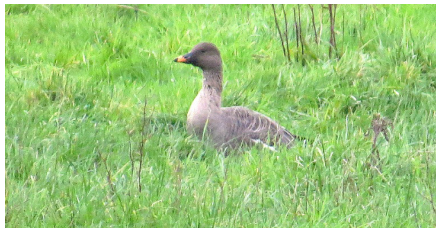
Tundra Bean Goose

On Christmas Day I heard that the south of England had an influx of Geese from Europe. So while dinner was cooking I walked to Throop meadow and low and behold I found a TUNDRA BEAN GOOSE with three GREYLAGS. It was never far from the Greylags so made the identification a bit easier as it is slightly smaller and does not have a big orange beak as the GREYLAGS do. It was present on the 25 th , 26 th , 27 th and 28 th then not seen again by me. The last TUNDRA BEAN GEESE we had was when I found four almost in the same place on the 27 th December 2006, 19 years ago, my how time flies!