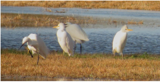
Cattle Egrets, Little Egrets at Moor Lane