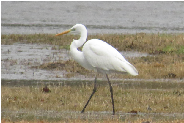
Great White Egret Moor Lane Meadow 12/1/26

Above The Hollow Track we have done more gorse control whilst encouraging native trees to return.