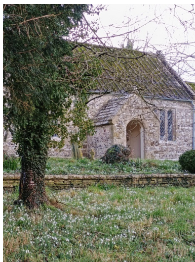
Snowdrops at Turnerspuddle