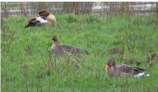
Tundra Bean Goose (middle) and Greylag (front) for comparison, with Wigeon (back)

On Christmas Day I heard that the south of England had an influx of Geese from Europe. So while dinner was cooking I walked to Throop meadow and low and behold I found a TUNDRA BEAN GOOSE with three GREYLAGS. It was never far from the Greylags so made the identification a bit easier as it is slightly smaller and does not have a big orange beak as the GREYLAGS do. It was present on the 25 th , 26 th , 27 th and 28 th then not seen again by me. The last TUNDRA BEAN GEESE we had was when I found four almost in the same place on the 27 th December 2006, 19 years ago, my how time flies!